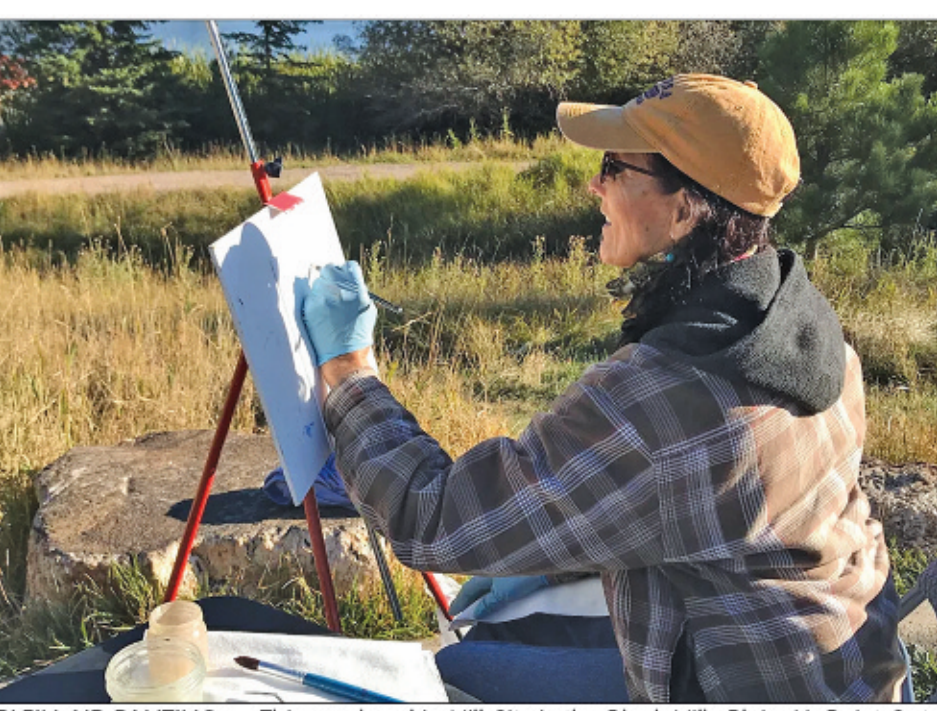
PLEIN AIR PANTING - This weekend in Hill City is the Black Hills Plein Air Paint Out, where artists will gather to paint outside, observe other artists painting and attend a reception with other artists as well as the public. [Submitted Photo]

Hermosa Town Board Hermosa Town Hall Hermosa, SD